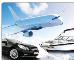
AUTOMOTIVE, MARINE & AIRCRAFT