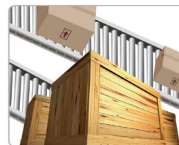
PACKAGING & CRATING