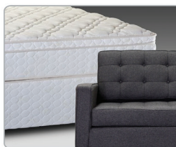
FURNITURE, BEDDING, SEWING & UPHOLSTERY