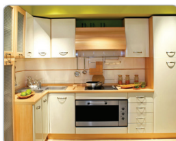
LAMINATE, CABINET, DISPLAY