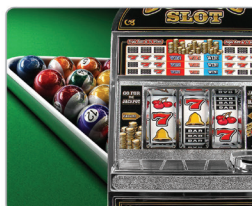
CASINOS, GAMING, BILLIARDS