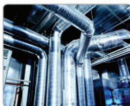
HVAC & ABATEMENT