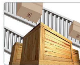
PACKAGING & CRATING