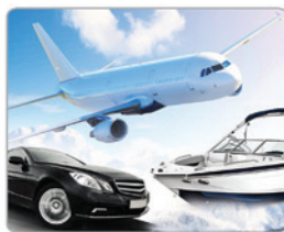
AUTOMOTIVE, MARINE & AIRCRAFT