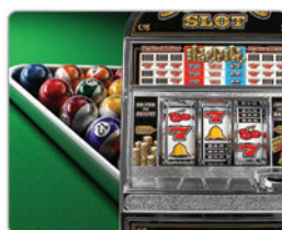
CASINOS, GAMING, BILLIARDS