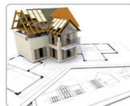
CONSTRUCTION, RV & MFG HOUSING