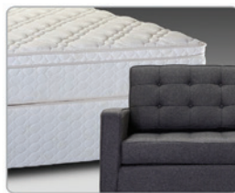
FURNITURE, BEDDING, SEWING & UPHOLSTERY