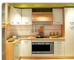
LAMINATE, CABINET, DISPLAY